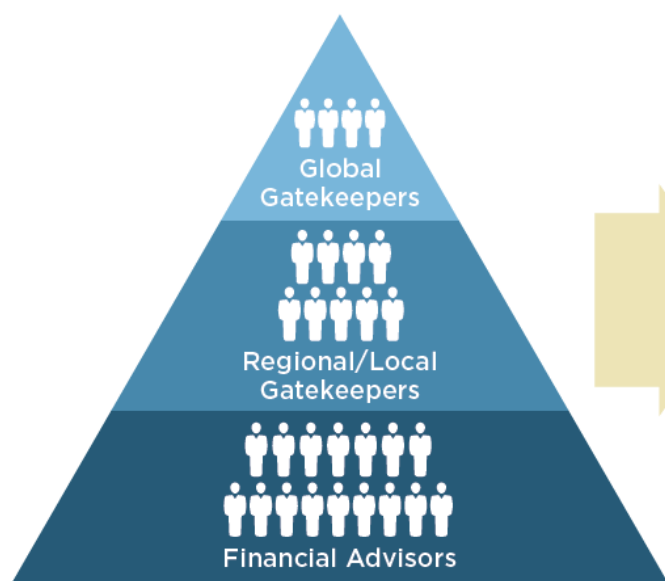
Manager selection pyramid