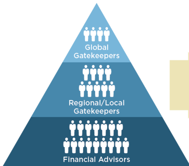
Manager selection pyramid